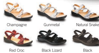
Champagne Gunmetal Natural Snake Red Croc Black Lizard Black