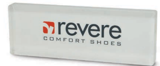
Acrylic Logo Block