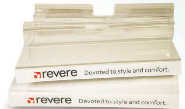
Branded Slatwall Shelves