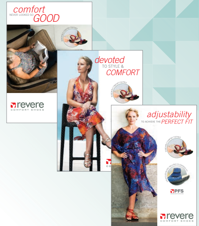
Display Strut Cards