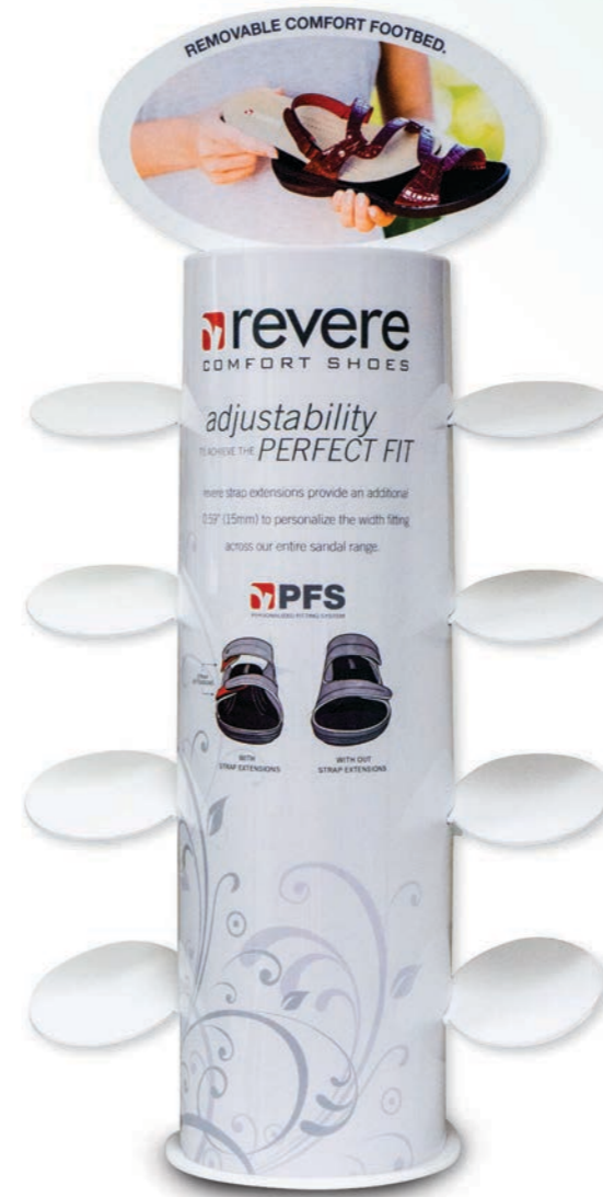
8 Shoe Table Top Stand with interchangeable, Seasonal Header