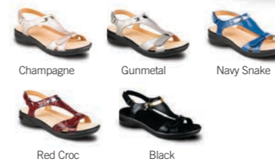
Champagne Gunmetal Navy Snake Red Croc Black